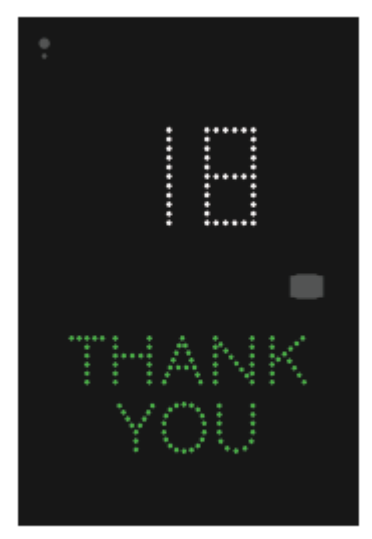
Display 1 (5-30mph)